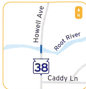
Above: Bridge deck overlay over Root River

Please note that all work is weather dependent and subject to change.