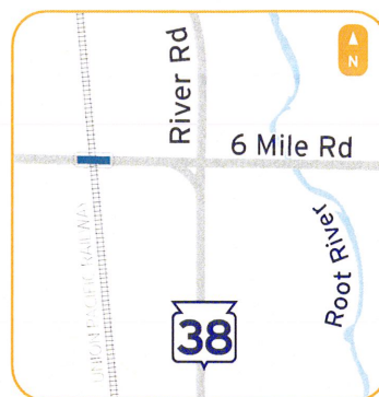
Above: Bridge deck overlay over Union Pacific Railway